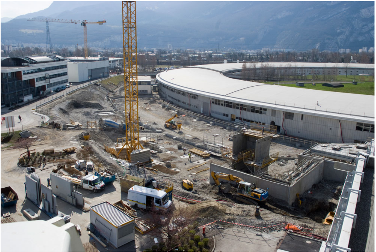
Figure 2: construction works for the Belledonne experimental hall.