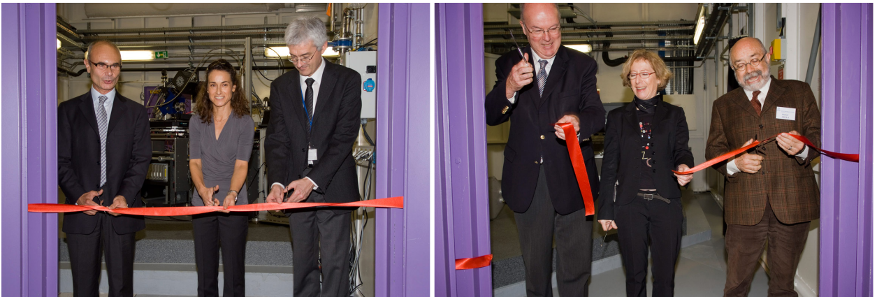
Figure 3: Inauguration of Upgrade Beamline ID24.