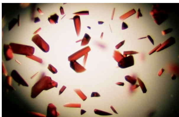
Figure 1. Crystals of reduced cytochrome c 6 from Synechococcus sp. PCC 7002.

The crystallization experiments used the hanging-drop vapor-diffusion method. Red crystals (Fig. 1) suitable for X-ray analysis were obtained from 10 mM sodium Hepes, pH 6.2, and 2.2 M ammonium sulfate over a period of one week.