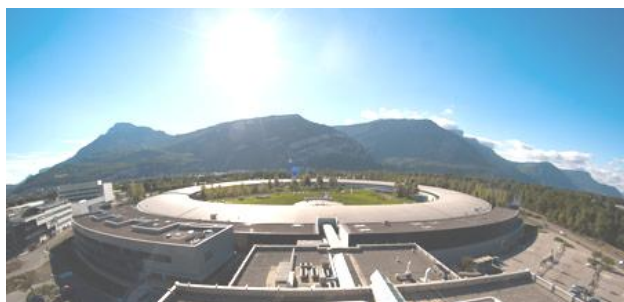
Figure 1. View of the ESRF synchrotron from above.

Starting from year 2004, Poland is an Associated Member of the European Synchrotron Radiation Facility (ESRF) in Grenoble, France. In the period from 2004-2006 with the contribution at the level of 0.6% of ESRF budget and in the period 2006-2011 at the level of 1%. Starting from October 2011 there was no a legal path to apply for paying the Polish contribution. Nevertheless, Polish government has declared that is working on solving this problem and the necessary changes in the law will be made but any agreement between Poland and ESRF was signed. In the absence of a valid agreement, securing the necessary funding was no longer possible. However, activities for the establishment of a new legal and financial mechanism enabling the renewal of the long-term arrangement have been actively ongoing since October 2011. Moreover, the Polish scientific community has continued to successfully use the ESRF at the same level as before and Polish post-docs and PhD students have continued to be welcomed in the ESRF staff complement, despite the fact that no formal arrangement has been in force between the Parties since October 2011 and that IF PAN (as representative of Poland) has not made any financial contribution to the ESRF during this period.