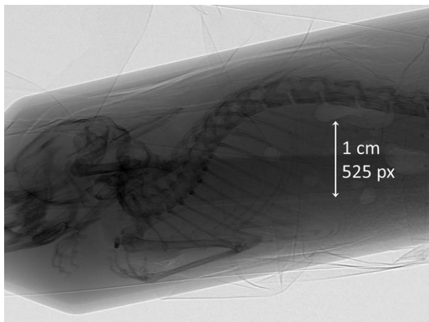
Figure 2. Full field phase image of euthanized mouse.

differences between healthy bone, which showed a uniform distribution of strontium, and subjects developing osteoarthritis, which showed pathological changes occurring in the bone microstructure. In particular, tracer was found beneath the cartilage and at bone margins, which eventually develop into bone spurs and limit normal joint movement. New X-ray optical instrumentation projects are being pursued at the BMIT beamlines to address the needs for various imaging programs, for example, an expander for dynamic real life imaging (Figure 2) [4] which allows the imaging of larger objects using a single frame.