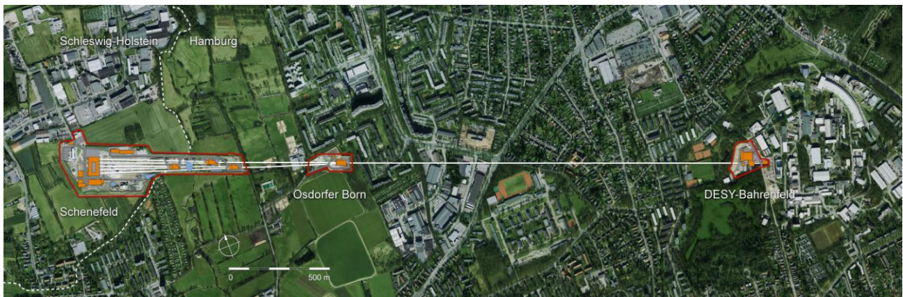
Figure 1. Aerial view of the European XFEL facility. The electron injector is located on the DESY campus in Hamburg, while the underground Experimental Hall hosting the scientific infrastructure dedicated to the user science program is located in nearby Schenefeld.